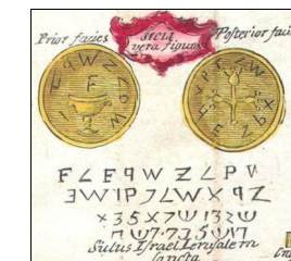
1632 sketch of the First Jewish Revolt coinage. 3

During the first Jewish Revolt against Rome, from 61 to 70 CE, which ended with the destruction of the Temple, Jews minted their own coins dated to the first, second, third, fourth, and, more rarely, the fifth year. In other words, the dating began with the beginning of the revolt.