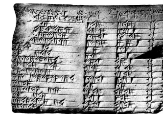
The Plimpton 322 clay tablet, with numbers written in cuneiform script. 2

considered to be the father of trigonometry. The examination of the tablet could revolutionize our understanding of Babylonian math.