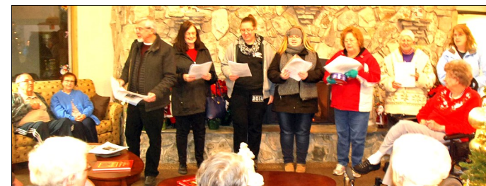
Elim carolers sing at Harrison Regent on December 19, 2016.