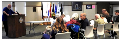
Elim and Ascension leads worship at the Wahlen Veterans' Home on August 27, 2017.

Elim and Ascension led the Protestant Worship Service at the George E. Wahlen Veterans' Home on Sunday, October 1.