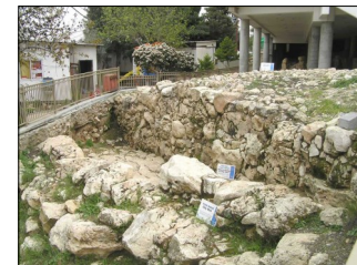
Excavations at Tel Rumeida. 1

According to the ancient Jewish historian Josephus, during the first revolt against Rome (66-76 CE *), the Zealot leader Simeon Bar-