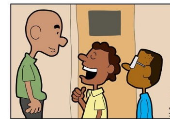
"I brought a friend today. Just call me The Great Commissioner."

As the Holidays approach, we are all given a set of great events to which we could invite our friends and relatives.