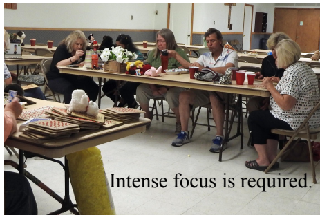
Intense focus is required.