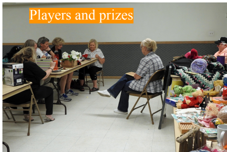
Players and prizes

Elim hosted its first Bingo night on Saturday, June 24th, for our interested members and friends. Plans include repeating the event in the future. Please come, and bring a friend, if you are a Bingo aficionado. The upcoming dates, when they are determined, will be posted on our facebook page and via emails to those on our email list. Let us know if you would like to be added to that list.