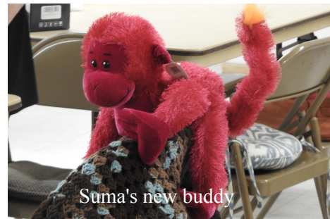
Suma's new buddy