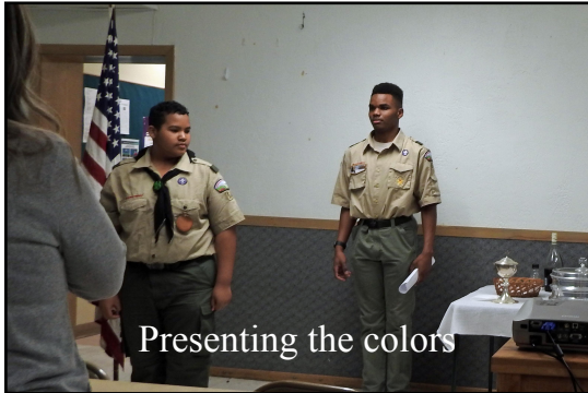
Presenting the colors

The service was a bit unusual, because a sanctuary broken furnace forced us downstairs - where, Dave T. reminded us, the very first meeting in the "new" (in 1949) church was held before the upstairs sanctuary was completed. The Scouts led the service, and we celebrated the great things, documented in a slide show, that Troop 54 has accomplished in 2022 and cheered them on for 2023! We applaud the troop's dedication to community service. Here are some photos from the day.